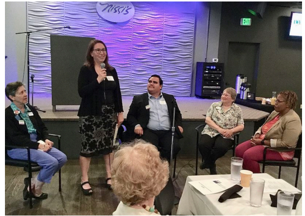
Diversity Discussion from 2018 annual meeting